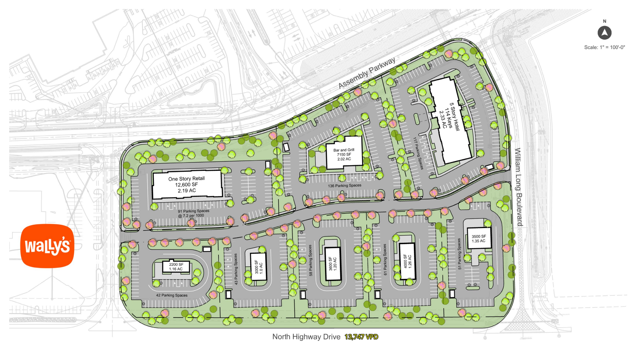
Interstate 44 96,516 VPD